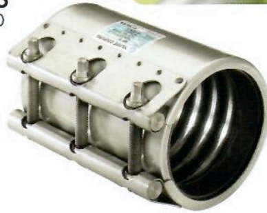
Model 4 : MF-RL (MULTI-FLEX - ROUND LONG)