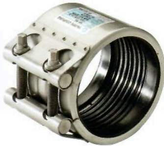
Model 3 : MF-RS (MULTI-FLEX - ROUND STANDARD)